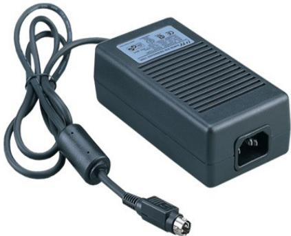
Dimension : L 155 × W 89 × H 50 mm AC Input : IEC 320-C14 Inlet