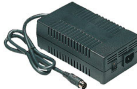
Dimension : L188.5×W104.5×H60mm AC Input : IEC 320-C14 Inlet